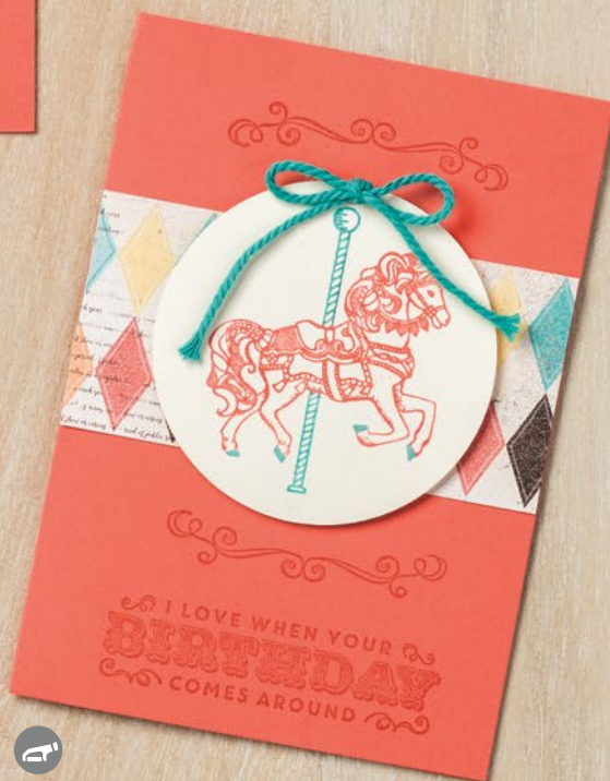
Stampin' Dimensionals 104430