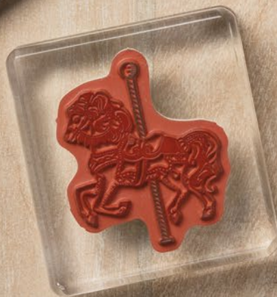
Carousel Birthday Stamp Set 142829 © 142832 ©

Bermuda Bay & Calypso Coral Stampin' Write Markers 142803