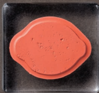
Lemon Zest Stamp Set 143805 ■ • 143808 ©