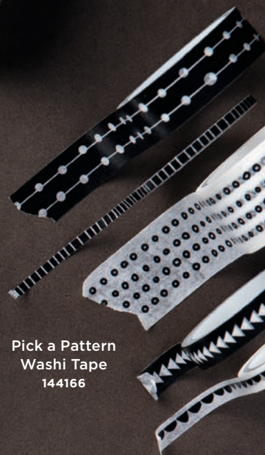
Pick a Pattern Washi Tape 144166