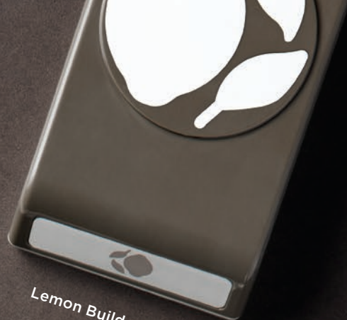
Lemon Builder Punch 143712