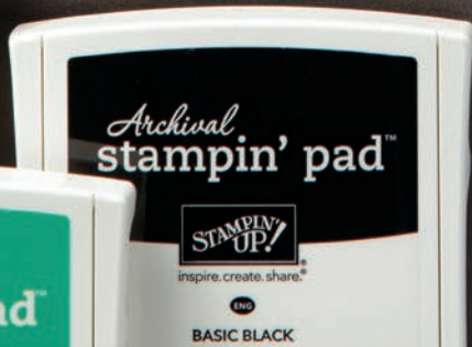
Basic Black Archival Stampin' Pad 140931